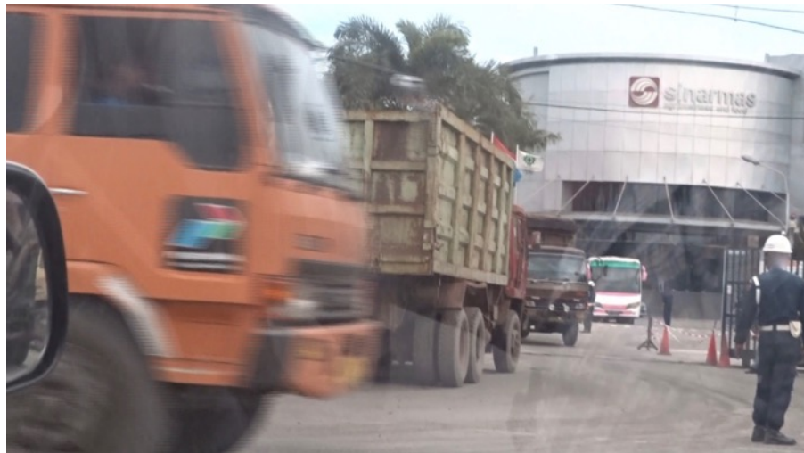
Golden Agri-Resources' Belawan Refinery and Kernel Crushing Plant. GPS: 3°46'42.99"N, 98°41'20.47"E

GAR has a crushing facility and refinery at the port and also states on its supplier list that it purchases crude palm oil and palm kernels from PT. Raja Marga. 7 GAR has not issued a public response since the release of RAN's latest report stating if it continues to source from PT. DPL via PT. Raja Marga or other mills in the region. As a matter of priority, GAR must stop sourcing from PT. Dua Perkasa Lestari.