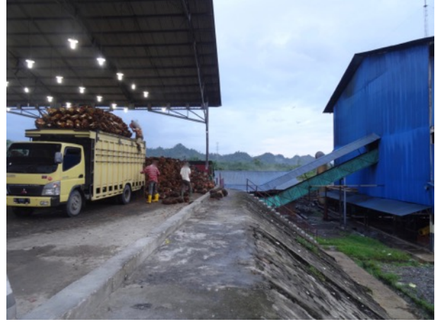
Truck arriving and unloading at PT Raja Marga. GPS: 3°59'7.73"N, 96°37'37.73"E

Weighing slip connecting PT. DPL and PT. Raja Marga