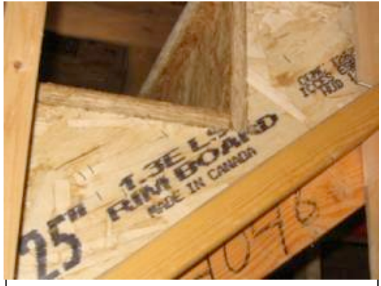
The Kenora mill is the only mill in Canada that manufactures LSL Rimboard

Stamps found on Engineered wood products used in Quadrant Homes definitively show that hardwood trees harvested from the Grassy Narrows Traditional Territory are used to build new homes marked under the "Built Green" program throughout the Puget Sound area in Washington. These photos were taken in the Quadrant Homes Northlake Ridge Development on February 18, 2006.