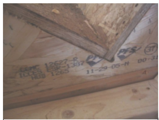
The "37" stamp indicates the plant number for Weyerhaeuser's Kenora Mill.