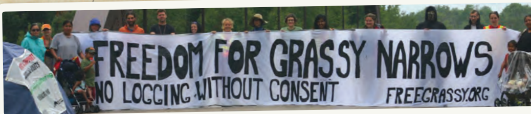
GRIZZLY BEAR ON THE COPPER RIVER, ALASKA. PHOTO: J. CRUISE; INDIGENOUS LEADERS BOARD A BUS TO PROTEST PLANS FOR THE BELO MONTE DAM. ALTAMIRA, BRAZIL. PHOTO: ANDRE PENNER / AP; MEMBERS AND SUPPORTERS OF GRASSY NARROWS FIRST NATION PROTEST LOGGING ON THEIR TRADITIONAL TERRITORY. ONTARIO, CANADA. PHOTO: RAN